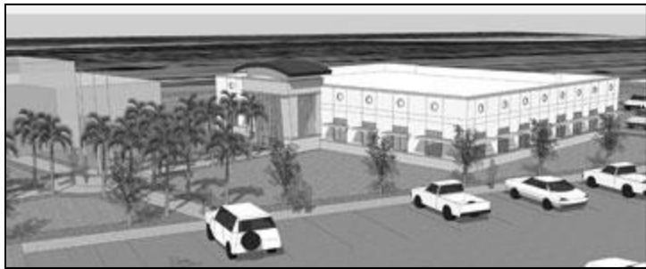
Rendering of the new Port Canaveral Joint Port Intelligence and Operation Center complex.